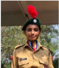
CDT Athira EC