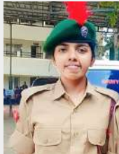
CDT Vismaya EC