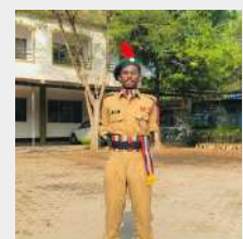
CDT Sillu EC