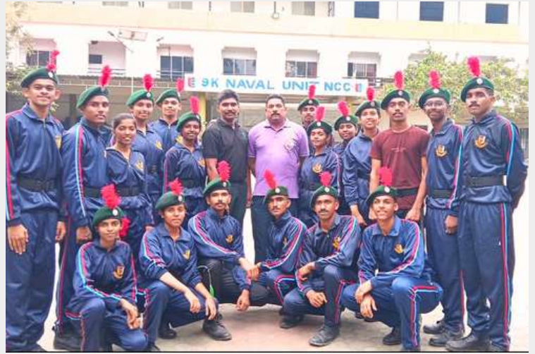
Combined Annual Training Camp Held at West Hill , Calicut

Firing, basics of Field&Battle craft. Practical classes included Tent pitching, First Aid, Disaster Management, Drill and primarily focused on wing specific activities. Cultural and sports were integral part of the camp.