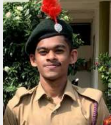
CDT Adharv EEE