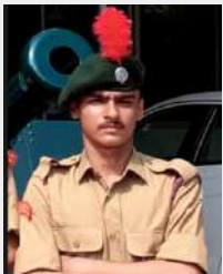
CDT Vyshnav EC