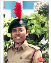
CDT Vrinda EC