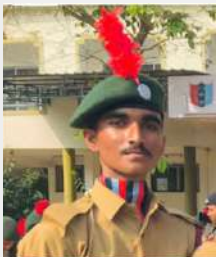
CDT Shanu EC