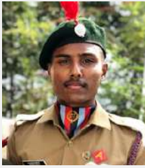
CDT Rishikesh EC